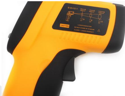
Diagram illustrating the D/S targeting ratio

The distance-to-spot ratio (D:S) is the ratio of the distance to the object and the diameter of the temperature measurement area. For instance if the D:S ratio is 12:1, measurement of an object 12 inches (30 cm) away will average the temperature over a 1-inch-diameter (25 mm) area. As the distance increases larger will be spot size